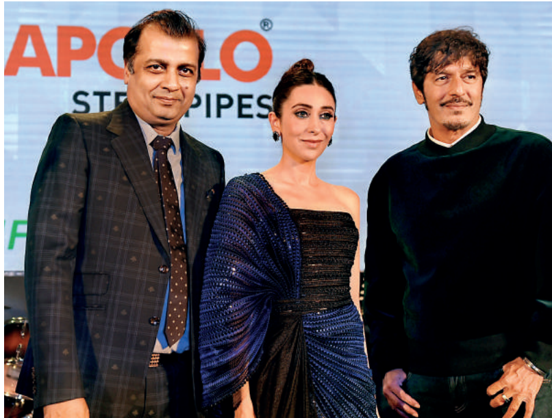
(L-R) Sanjay Gupta, Karisma Kapoor and Chunky Panday