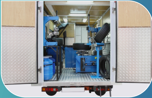
Bus/ Truck Body